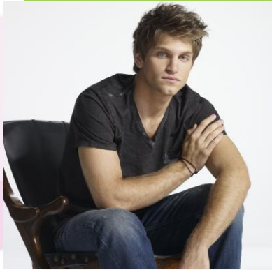
Keegan Allen From Pretty Little Liars