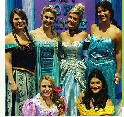
Princesses From Just a Bit of Pixie Dust