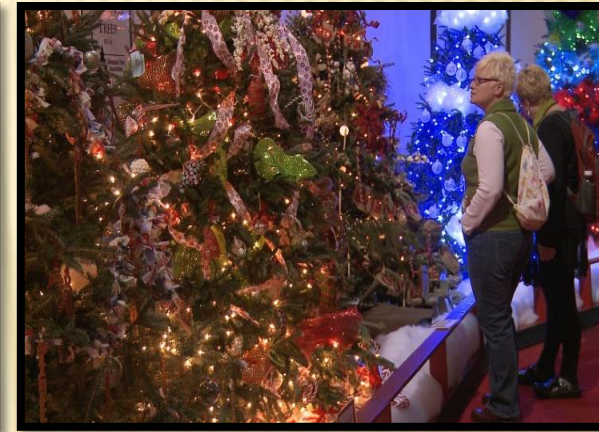
Christmas Tree Lane