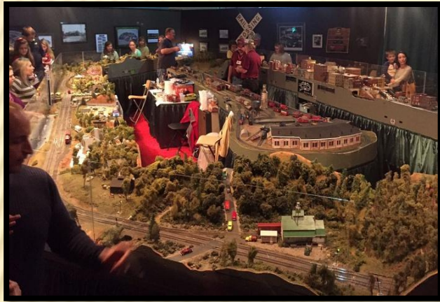
Metrolina Model Trains