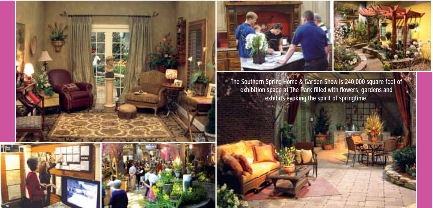
The Southern Spring Home & Garden Show is 240,000 square feet of exhibition space at The Park filled with flowers, gardens and exhibits evoking the spirit of springtime.